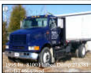
1995 Int. 8100 Flatbed Dump 278381 mi. DT466, 9spd