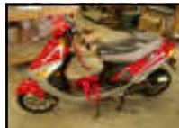
Baja SC 50 Moped 328 mi.