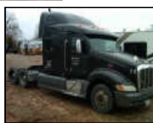
2000 Peterbilt (no engine nor trans)