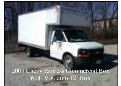
2003 Chevy Express Commercial Box 6.0L V-8, auto 12' Box