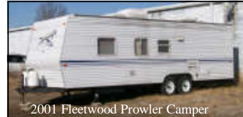
2001 Fleetwood Prowler Camper