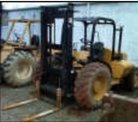
Eagle Pincher 4WD 6172 hrs