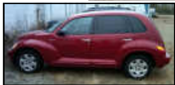
2005 Chrysler PT Cruiser 18,928 mi.