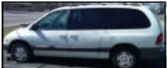
2000 Dodge Caravan 134659 mi.