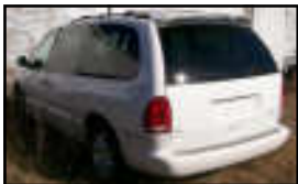
2000 Dodge Sport Van