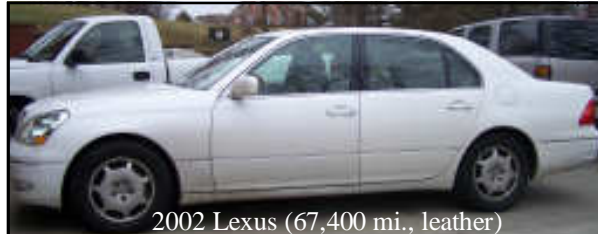
2002 Lexus (67,400 mi., leather)