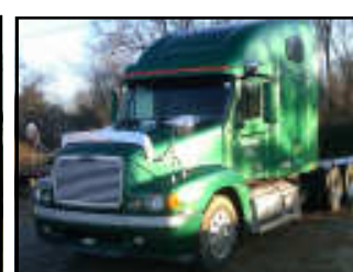
2001 Freightliner Century, ISX, Eaton auto10 (engine down)