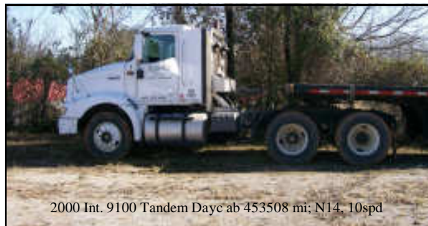
2000 Int. 9100 Tandem Daycab 453508 mi; N14, 10spd