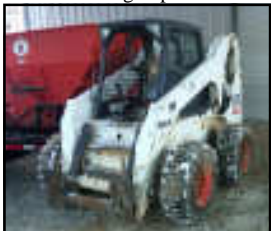
2004 Bobcat S300 25950 hrs.