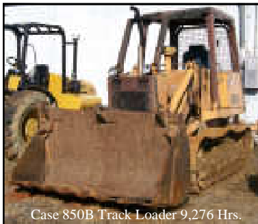
Case 850B Track Loader 9,276 Hrs.