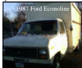
1987 Ford Econoline