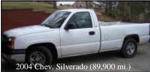
2004 Chev. Silverado (89,900 mi.)

Trucks, Trailers, Equip., Skid Steer, Farm Equip, Vehicles, Harley