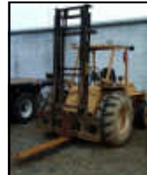
1996 MasterCraft 2765