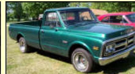
72 GMC 1500 Super Custom 350 83k mi.