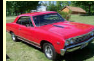
'67 Chevy Chevelle Malibu (14K Mi)

ROOM TO ROAM... This spacious home features four bedrooms, three baths, family room, kitchen w/dining area, study, two bonus rooms & FULL BASEMENT. Kitchen has lots of custom oak cabinets, side-by-side Refrigerator, range w/ceramic cook top & dishwasher. Master bedroom (22'x28') features walk-in closet, private deck, entrance to patio, balcony. Master bath has whirlpool tub & walk-in shower. Three CH&A (el) units, Covered front & rear porches, Large concrete patio, deck & architectural shingles (Mar., 2010)