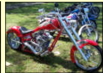
'03 Arlen Ness Chopper

www.taysauctions.com 1546 E SPRING ST STE B COOKEVILLE TN 38506 (931) 526-2307