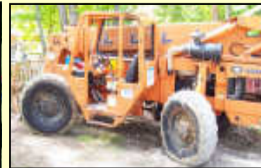
99 Lull 644d-42