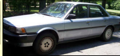
1987 Toyota Camry -4 dr. 107396 mi.