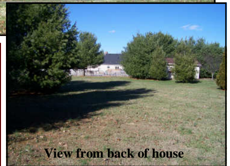
View from back of house