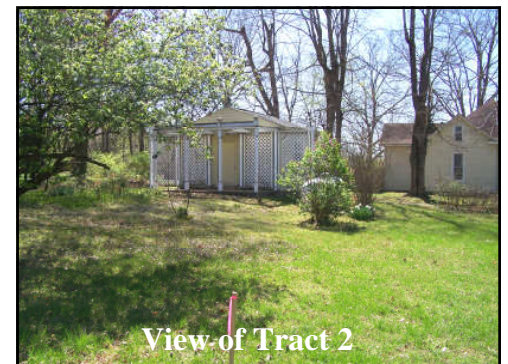
View of Tract 2