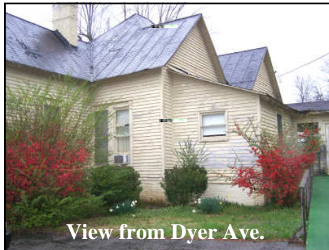
View from Dyer Ave.